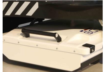
Stream C antenna array