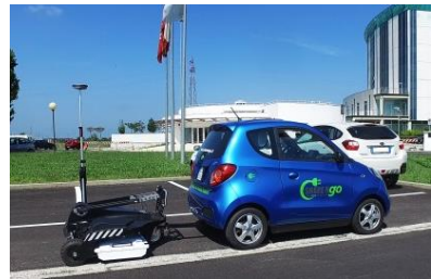
Stream C with vehicle towing kit