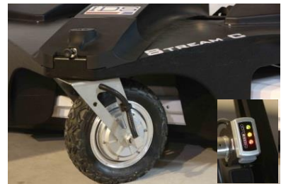
Stream C pivoting and motorized front wheel