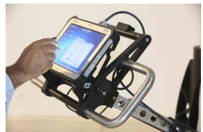
Stream C adjustable handle